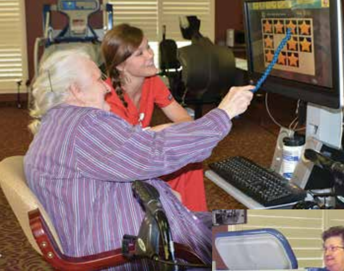
Rehab and Fitness Gym